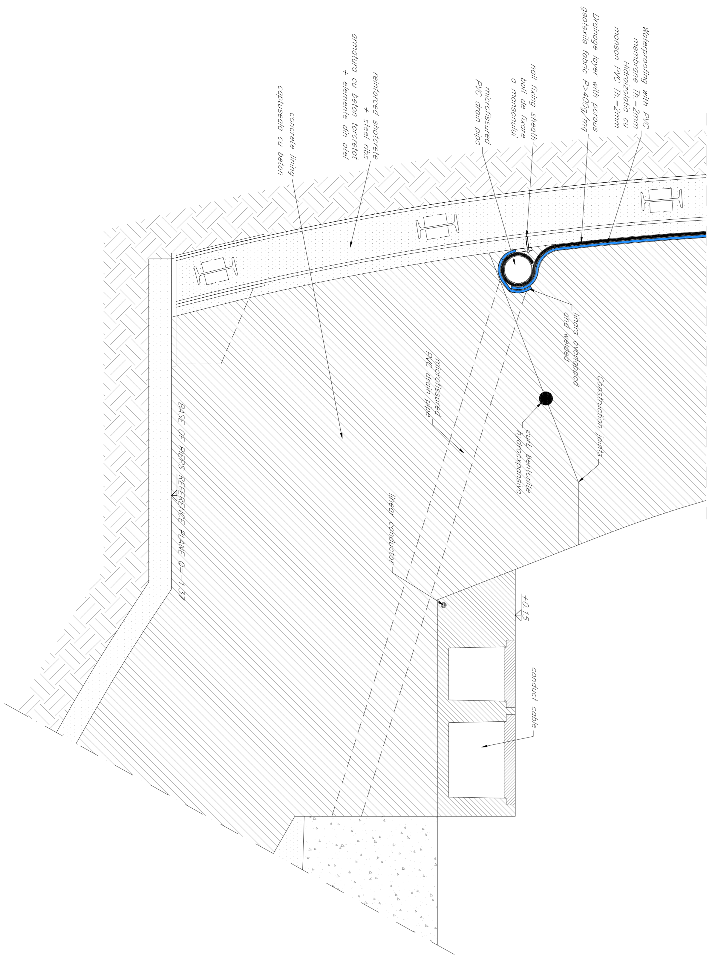
WATERPROOFING DETAIL DETALIUL HIDROIZOLATIEI Scale/Scara 1:10